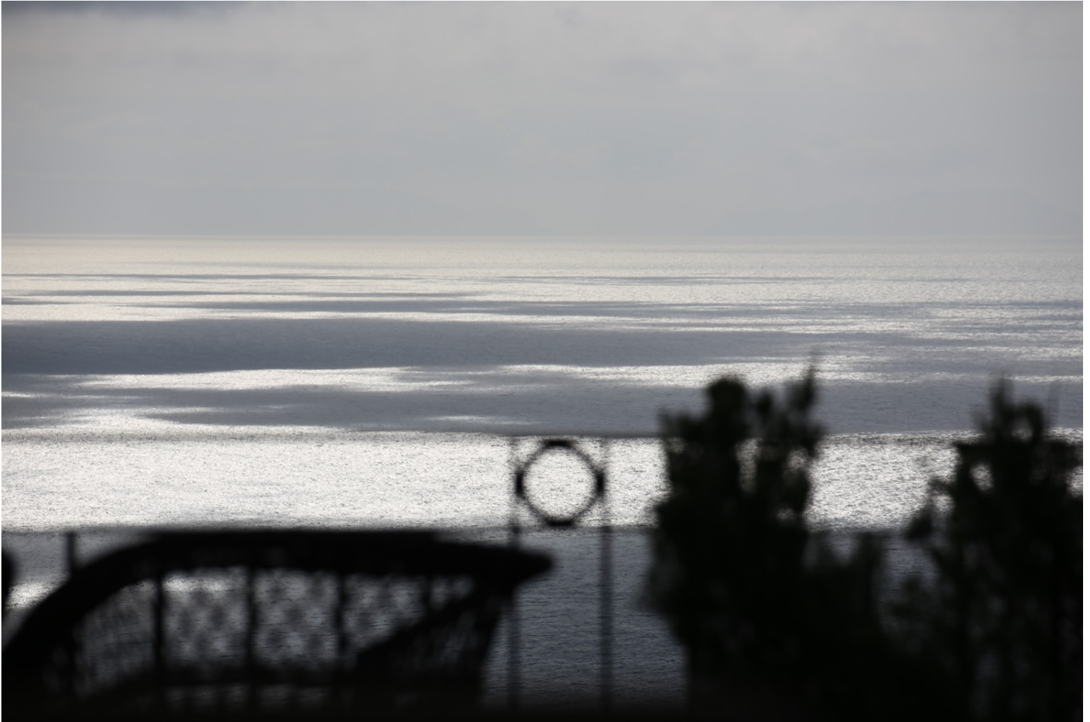
All photos taken from the terrace of the Casa da Levada in Funchal in April 2013